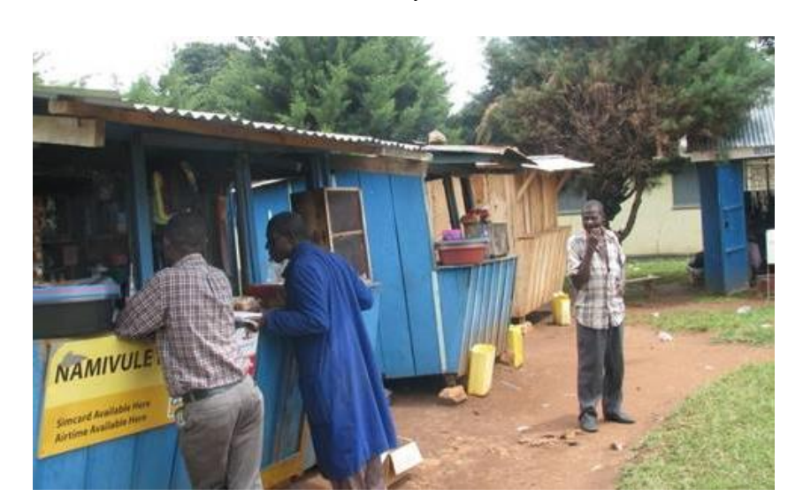
Plate 1: Example of wooden movable kiosks near health centers which vend retail goods to patients and medical staff.

Potential resettlement impacts are given in table below.